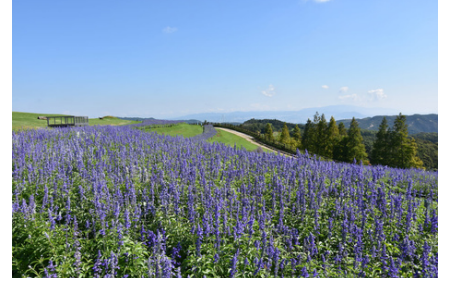
淡路島 Awaji Island