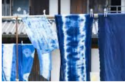
藍染 Aizome Dyeing