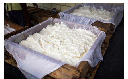
豆腐作り Tofu Making