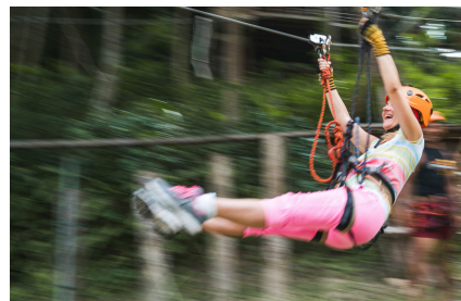
ネスタリゾート Zip Line