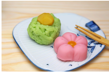
和菓子作り体験 Wagashi Sweets Making