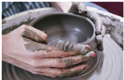
陶芸 Pottery Workshop