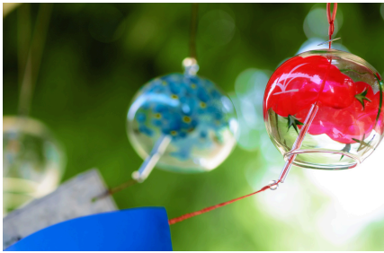
風鈴作り体験 Wind Chime Making