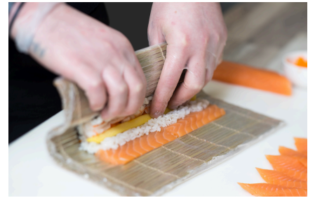
お寿司作り体験 Sushi Making