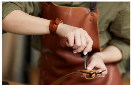
レザークラフト Leather Craft